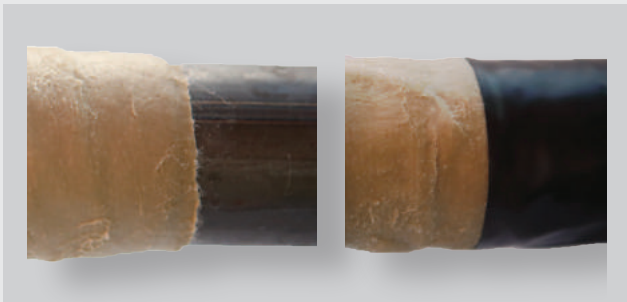
Plid Wrap on pipe

PLID WRAP is a wax tape infused with S2S HD, our strongest, longest lasting formula.